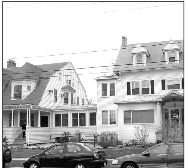
The Hartford Family Institue offices are on Highland Street.

The Hartford Family Institute is located at 17 South Highland Street. Call 236-6009 or go to www.hartfordfamilyinstitute.com for more information.